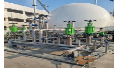
인천공항 T2 LH2 액화수소 충전소(SK) LH2 TANK SKID 제작(범한메카텍)