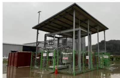
국내최초 LH2 제조/충전시설준공(충남TP)