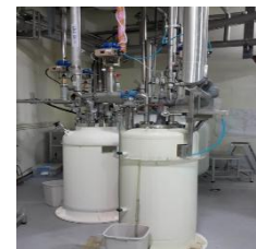
핵융합연구소/가속기연구소 극저온압력용기 제작