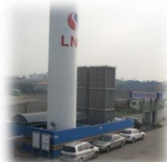
국내최초 LCNG 충전소 3개소 준공

(주)두진은 1994년 이래 CHART INC(차트/前 MVE)사의 국내 공식 AGENT 입니다.