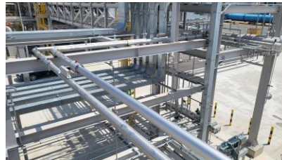
국내최초 하이창원(두산중공업) LH2플랜트 진공단열배관 제작/설치공사

두진은 초저온 Engineering을 포함하여 초저온기자재, 장비 등의 설계부터 시공, 인허가 까지 초저온 토탈 솔루션 기업으로서 유지보수, 기술지원 및 공급 체제를 갖추고 있습니다.